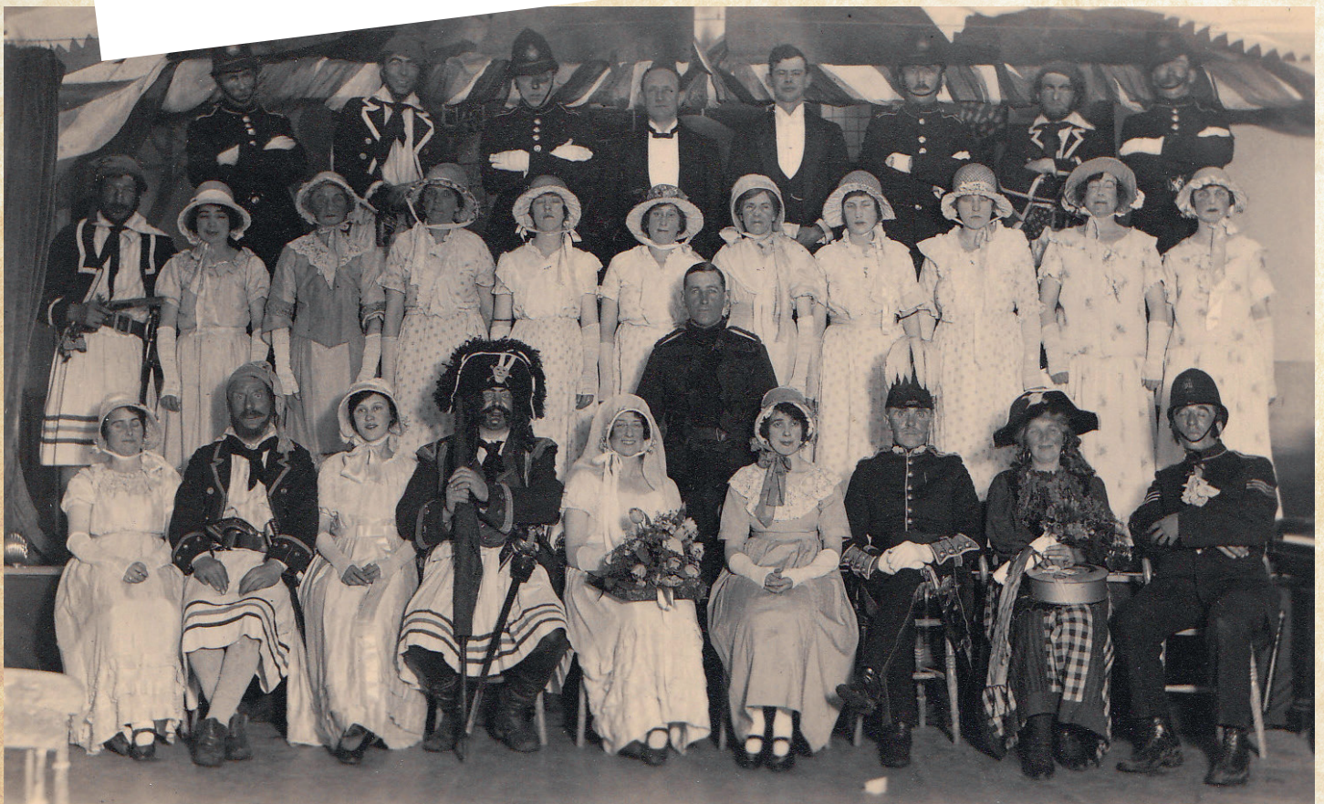
The Pirates of Penzance Cast - 1923